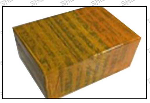
Pic No. 2 International express packaging: Wrapped with yellow tape after wrapping black protective film