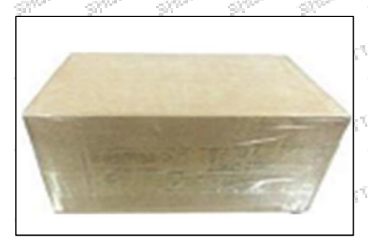
Pic No. 1 Domestic express packaging: Wrapped with Transparent tape

Minors are prohibited from using transparent tape, yellow tape, black wrapping protective film, and white wrapping protective film to avoid personal injury.